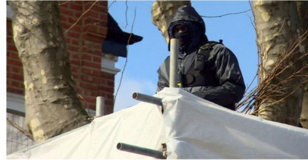
Security officers from the council have been providing round-the-clock surveillance on the tree